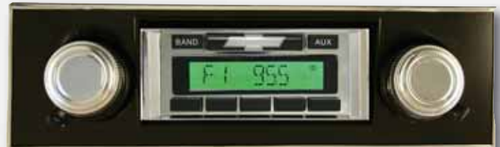
USA-230 Shown in '67-'68 Camaro