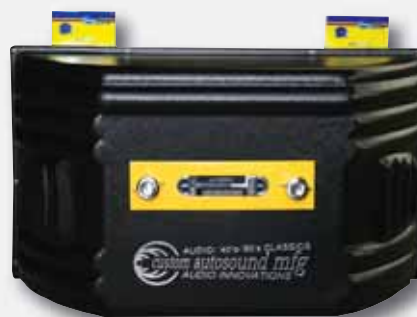
1 Radio Display

Two Radio Display Dimensions 24 1/2" wide x 9" Deep x 20" High