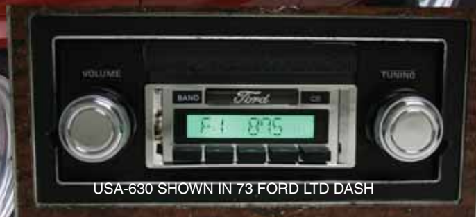
USA-630 SHOWN IN 73 FORD LTD DASH