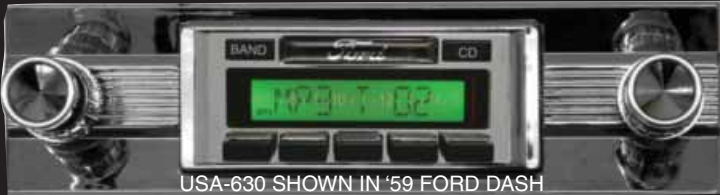
USA-630 SHOWN IN '59 FORD DASH