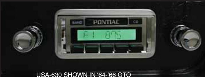
USA-630 SHOWN IN '64-'66 GTO