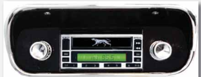
Shown in '67 - '73 Cougar Dash