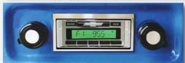
USA-230 Shown in '67-'72 Chevy Truck Dash