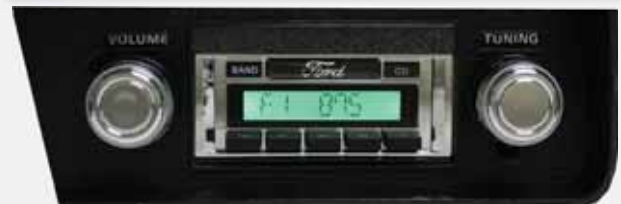
USA-630 Shown in '72-'79 Torino Dash