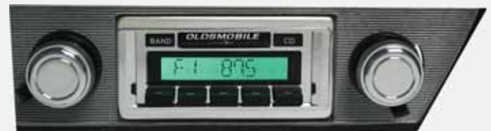
USA-630 Shown in '65 Oldsmobile Cutlass