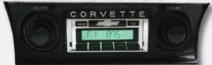
USA-630 Shown in '68-'76 Corvette Dash