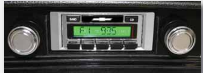
USA-630 Shown in '69-'72 Chevelle Dash