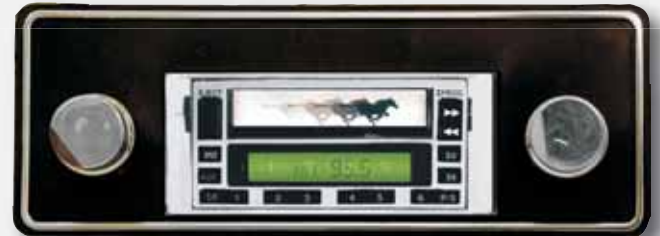
Shown in '79 - '84 Mustang Dash