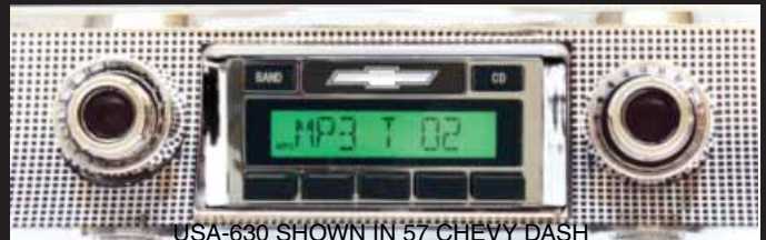
USA-630 SHOWN IN 57 CHEVY DASH