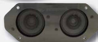
1000 Series Speaker