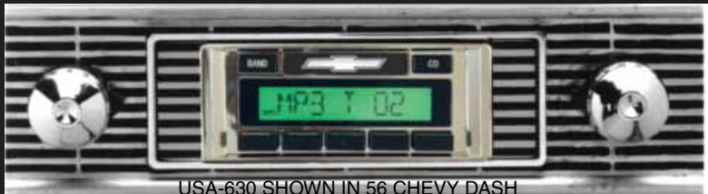
USA-630 SHOWN IN 56 CHEVY DASH