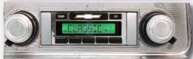
USA-630 Shown in '64 Chevelle Dash