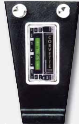
Shown in '63 - '67 Corvette Dash